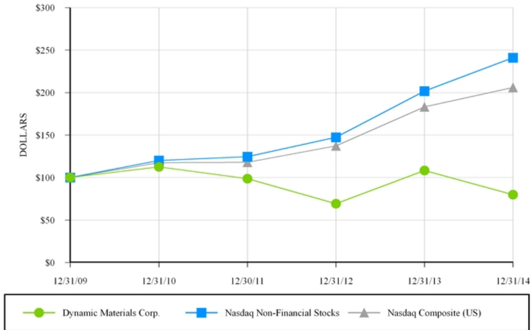
Total Performance Using OMX Global Indexes

The following graph compares the performance of our common stock with the Nasdaq Non-Financial Stocks Index and the Nasdaq Composite (U.S.) Index. The comparison of total return (change in year-end stock price plus reinvested dividends) for each of the years assumes that $100 was invested on December 31, 2009, in each of the Company, Nasdaq Non-Financial Stocks Index and the Nasdaq Composite (U.S.) Index with investment weighted on the basis of market capitalization. Historical results are not necessarily indicative of future performance.